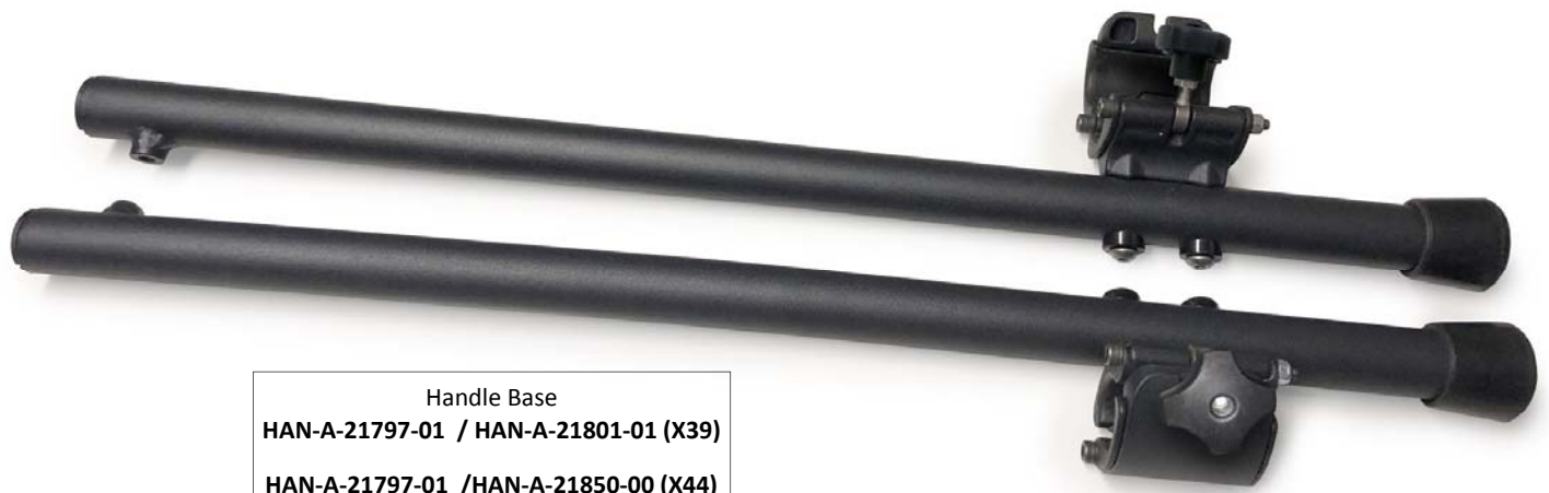
Handle Base HAN-A-21797-01 / HAN-A-21801-01 (X39) HAN-A-21797-01 / HAN-A-21850-00 (X44)

1) Familiarize yourself with the Handle Bases [HAN-A-21797-01 / HAN-A-21801-01 (X39) or HAN-A-21850-00 (X44)], and that the two parts could be described as being "mirror images" of each other.