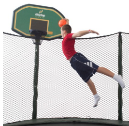
Catch Air like the Pros!

Look for these other accessories for your JumpSport™ Product: