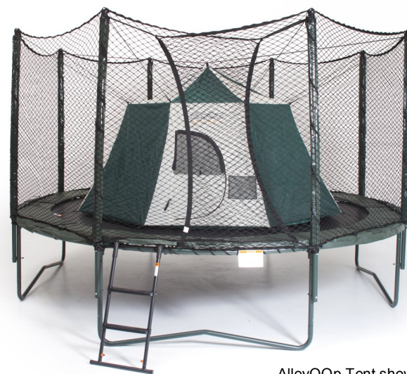
AlleyOOp Tent shown.

Step 5 - Start at the entrance with one of the 8 pre-installed, lower cords. To install the lower cord, pull it underneath the frame pad and rail to the adjacent leg. Wrap cord around the leg and pole and connect hook back to cord. Repeat step 5 for each of the remaining 7 lower cords around the tent.